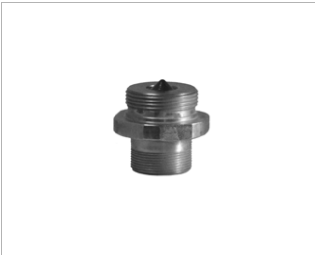
Screw-in part UNEF 1 1/8"