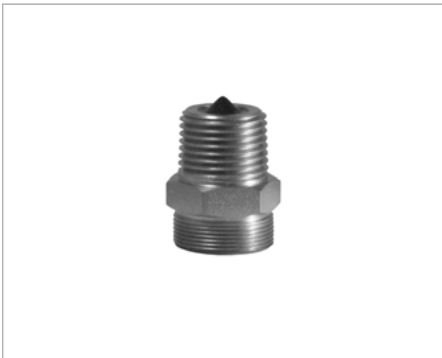
Screw-in part NPT 1/2" kurz