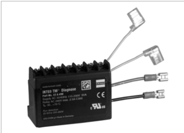
INT69 TM Diagnose