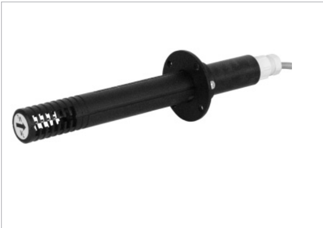
INT510 Air flow sensor